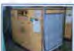
KAESER AIR COMPRESSOR