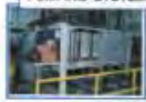
OIL AND WATER SEPARATOR