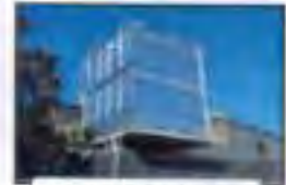
COOLING TOWER and PUMPING SYSTEM