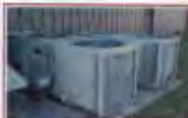
TRANE A/C SYSTEMS