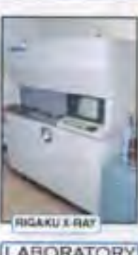
RIGAKU X-RAY LABORATORY