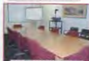
Conference Table with Chairs