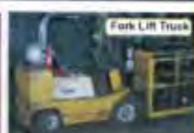
Fork Lift Truck