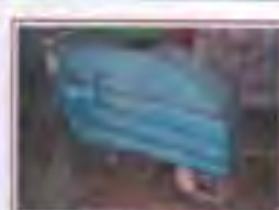
TENANT FLOOR SCRUBBER